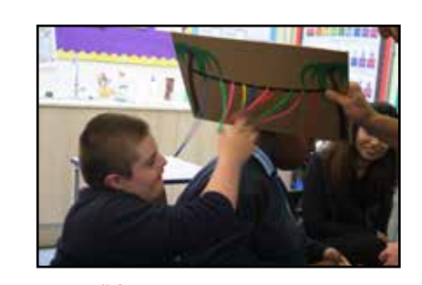
"If you go near the trees, watch out for the snakes!"