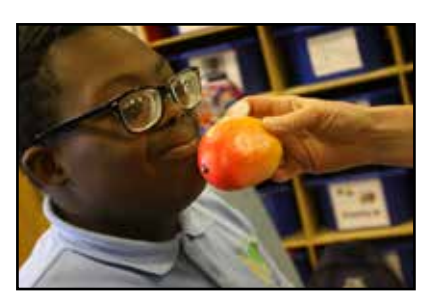
When they got to the island, they could smell something sweet and tropical. "Mangos!"